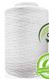
REPREVE® recycled fiber